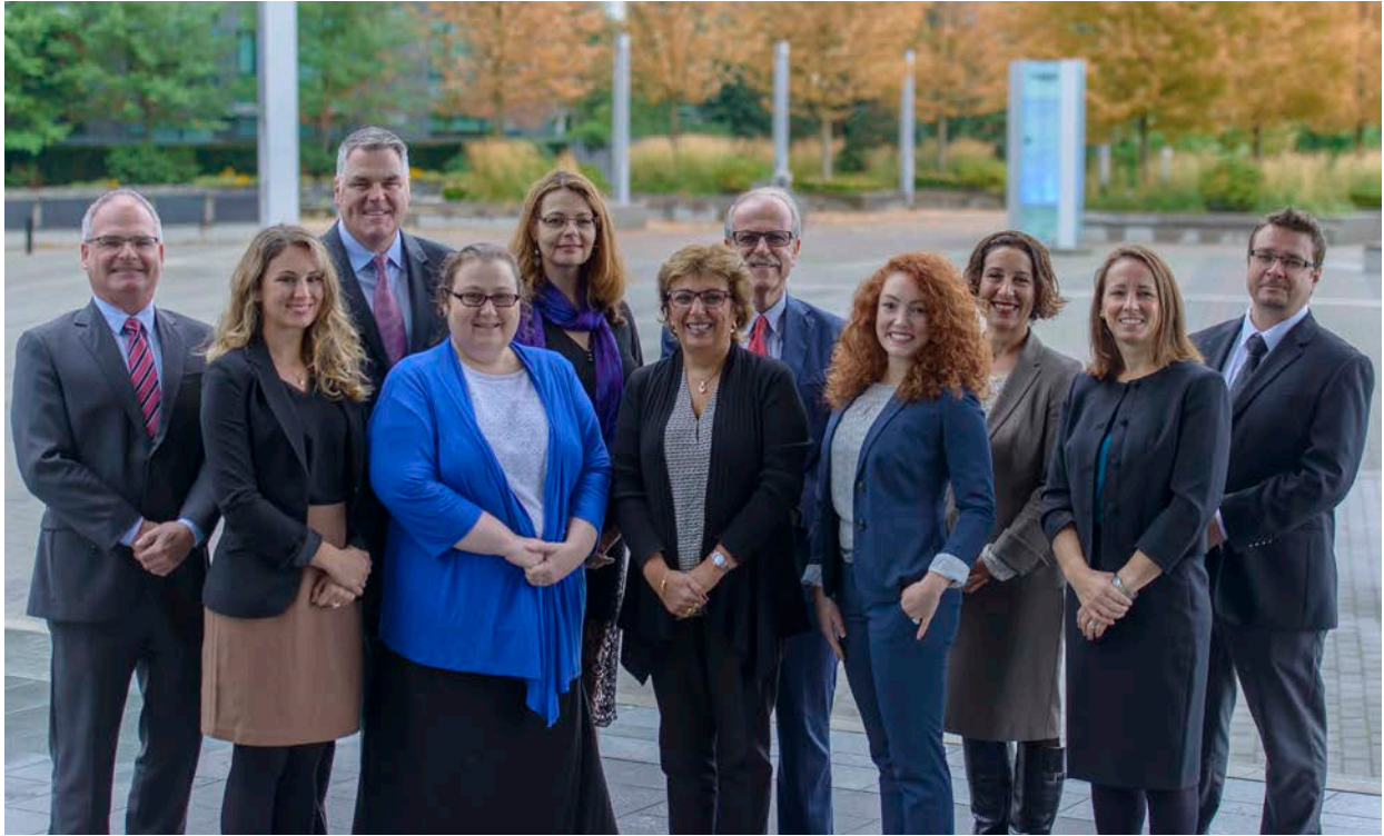
Business Council of British Columbia Team, September 2017